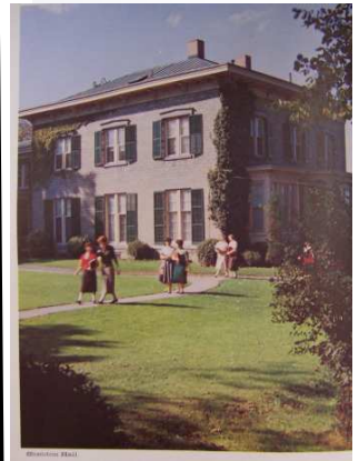
The house when it was a girls dorm

Another new plan that we have put into effect this past year is that we are now requiring all actives to come up with a $100 security deposit. At the end of each semester we then go around to see if there is any damage to the house and deduct it from all of the security deposits. I would like to caution any alumni that plans on making a trip to 8 Montcalm St. to be aware that the actives are instructed to turn in anyone that gets out of hand and does any damage to the house as they know that they as actives are going to have to foot the bill. I certainly hope that this will not be the case. We have also installed a new steel door on the Montcalm side of the house and the front door is always locked to keep out undesirables. Should you de-