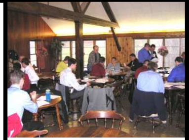
Fall STCAA Meeting at Fallbrook

At the 2007 Spring STCAA meeting on April 28 th with the active brothers nominations were taken and elections were held for new STCAA officers** .